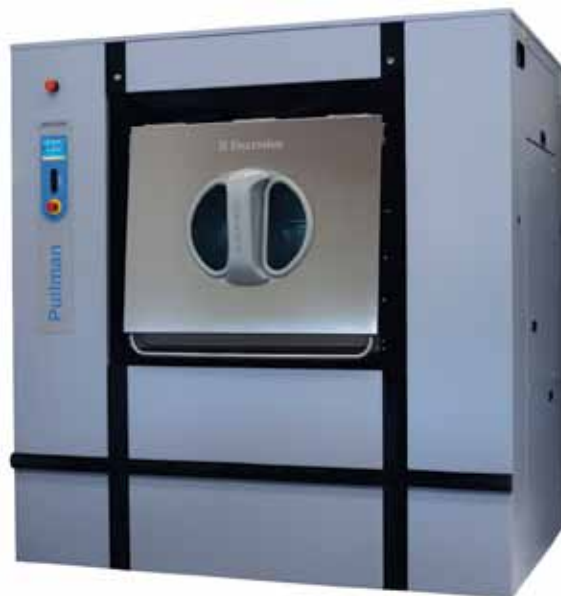
Images shown are a representation of the product only and variations may occur.